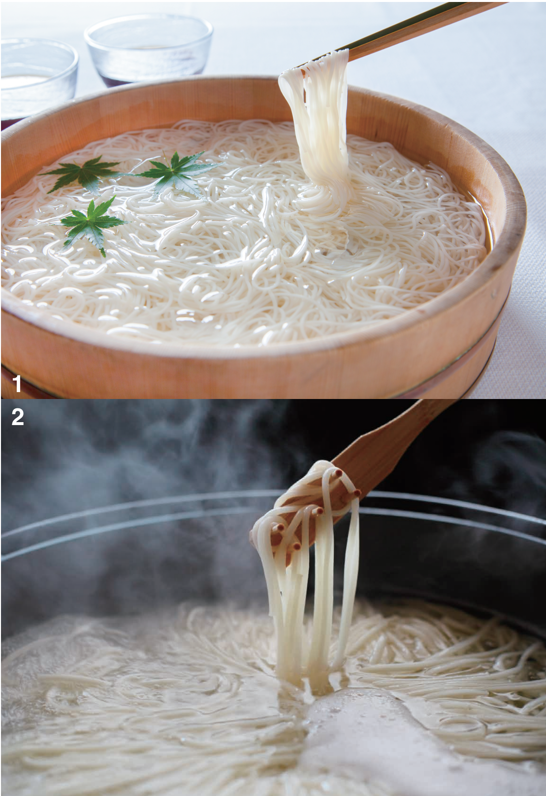
Food in Nagasaki ②